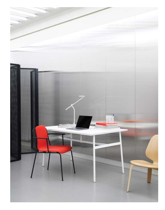
Studio Armchair full upholstery steel