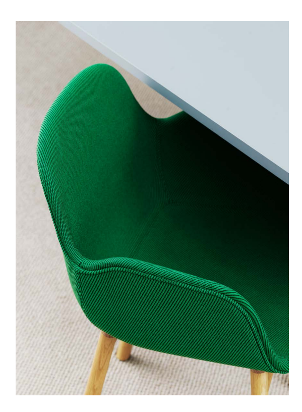
Form Armchair full upholstery oak