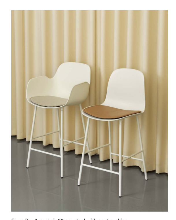
Form Bar Armchair 65 cm steel with seat cushion, Form Bar Chair 65 cm steel with seat cushion