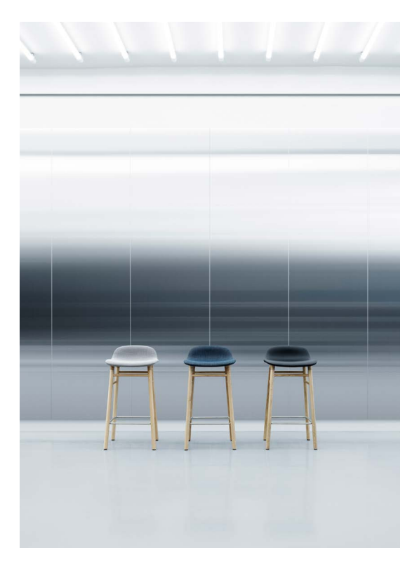
Form Barstool 65 cm full upholstery oak