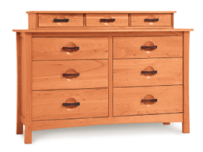
6 Drawer and Accesory Case 2-BERC-60-XX