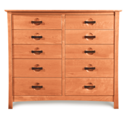
10 Drawer 2-BERC-80-XX