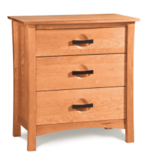
3 Drawer 2-BERC-30-XX